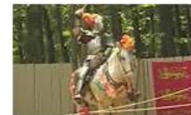
The Medieval Tournament The Freelancers