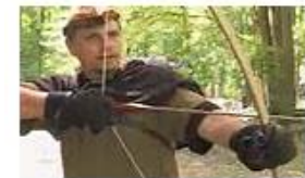
The Longbow Robinhood

The goal of The Middle Ages is to help students understand the basic concepts of this historical period, including the barbarian invasions, feudalism, the Crusades, the devastation of the plague, the causes of the Renaissance and the beginning of the Reformation. This is accomplished through hands-on and project-based activities.